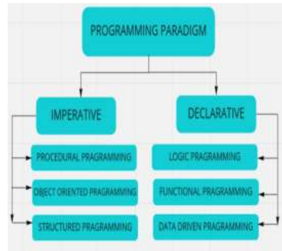
Image 1. Programming Paradigms

The first two fundamentals were practical & the third fundamental was never practical. It had only theoretical significance. Use sequence and selection in programs. The ways to carry duplicates into a routine. Reducing the programming length, and case structure. A program is a sequence of commands in its state. Structured programming are kind of imperative programming. Programming reduces code duplication. Object-oriented programming time as structured. Encapsulation of the rules of special method reference to the field. The solution to the problem is their instance. A software system uses a design pattern.